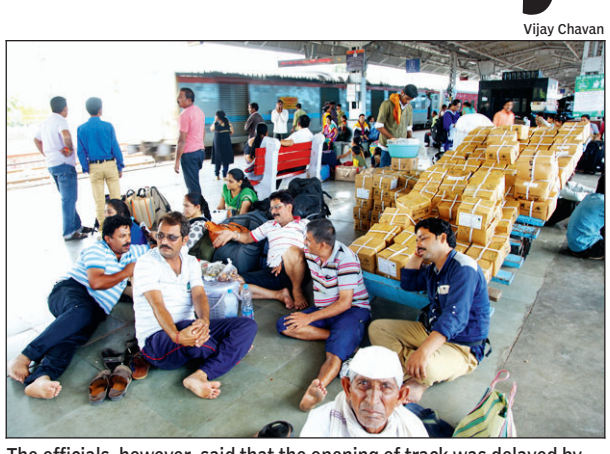
The officials, however, said that the opening of track was delayed by several hours

line has now helped trains, coming from Mumbai, pass the spot non-stop albeit at low speed — around 30-km per hour. "Till now the trains were run